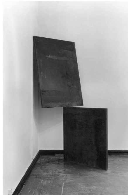
Richard Serra Corner Prop No. 6 (Leena and Tuula), 1983 Steel (2 parts) Top plate: 195x150x5 cm Bottom plate: 150x100x5 cm Estimate: € 600,000 – 800,000

The section of Post War Art is led by Georg Baselitz's monumental work "Hofteich". Estimated at € 700,000-900,000, this is the first time that it is offered on the auction market. It was made in 1975, the year the artist represented Germany at the XIII Sao Paulo Biennial.