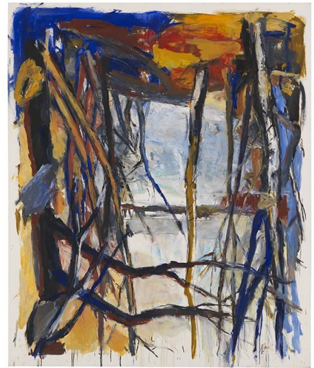
Georg Baselitz Hofteich, 1975 Oil on canvas 200 x 161 cm