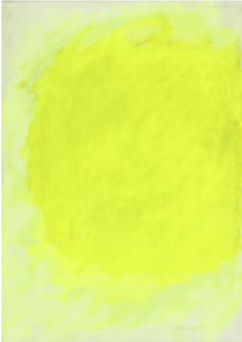
Arnulf Rainer Gelbe Übermalung, 1958 Oil on canvas, 70 x 50 cm