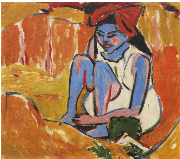
Ernst Ludwig Kirchner – Das blaue Mädchen in der Sonne Oil on canvas, 1910 32.4 x 36.4 in Estimate price: US$ 2,200,000-3,300,000