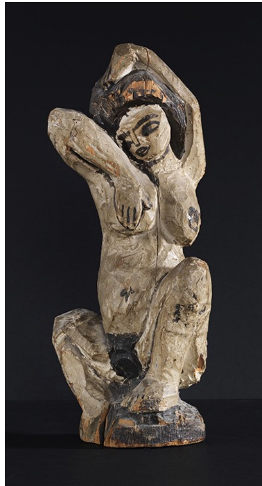
Ernst Ludwig Kirchner – Hockende