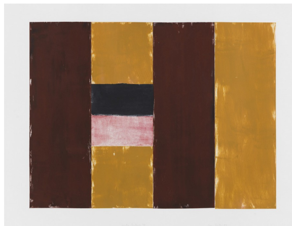
Sean Scully – Santa Barbara 34, 1987

This fascinating work with a tremendous appeal comes from Scully's first work series made in the print technique monotype. It is considered the origin of Scully's passionate occupation with print art, which lasts on up until today. Many works from the famous "Santa Barbara Series" can be found in important museum in London (Tate Gallery) and the USA (Albright-Knox in Buffalo and Minneapolis Institute of Art).