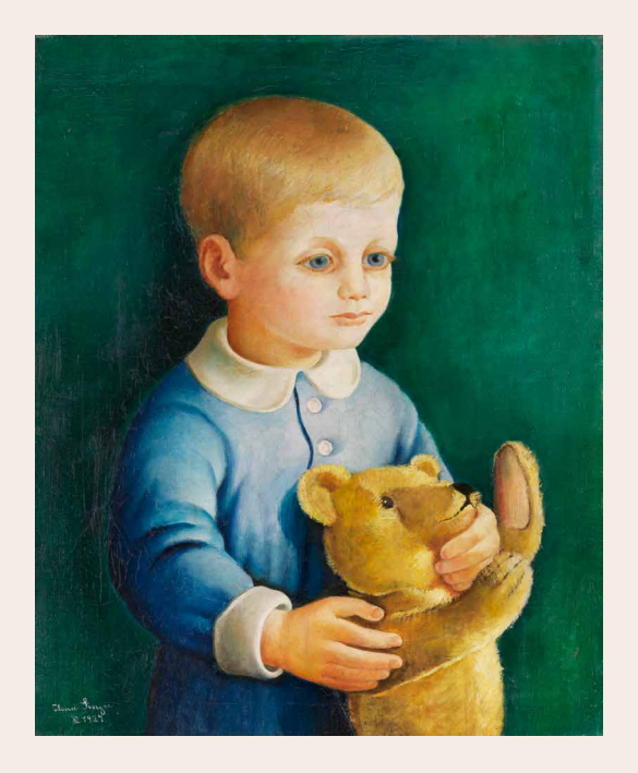
Modern Art Day Sale, June 18, 2021