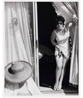
Cindy Sherman Untitled Film Still #7, 1978.