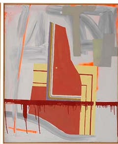
Martin Kippenberger Gruga-Bad, 1982.