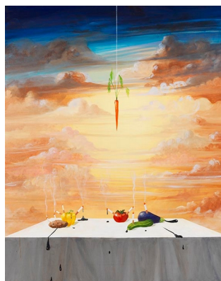
George Condo The Life We Love, 2004.