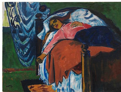
Hermann Max Pechstein Die Ruhende, 1911.