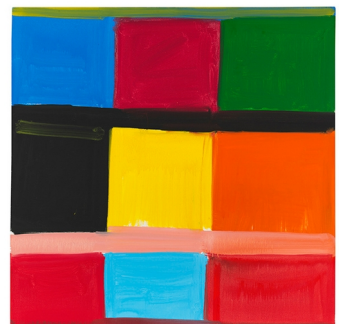
Stanley Whitney Stay Song #54, 2019 .