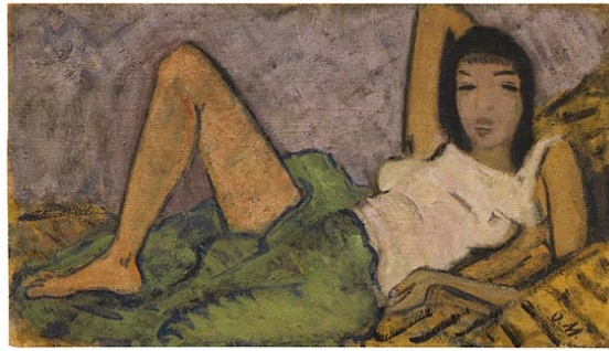
Otto Mueller Mädchen auf dem Kanapee, 1914