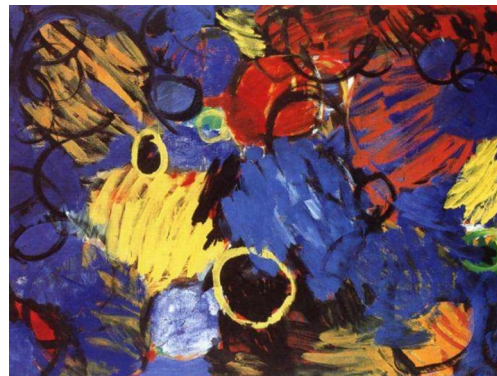
Ernst Wilhelm Nay Motion, 1962