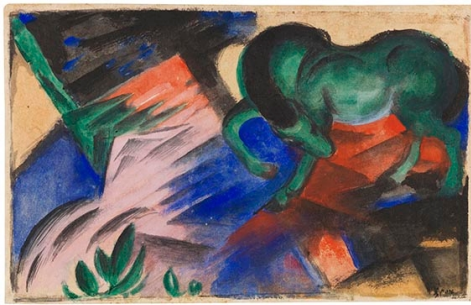
Franz Marc Grünes Pferd, 1912.