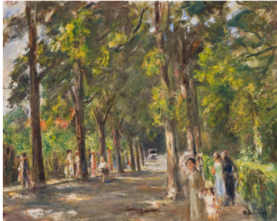
Max Liebermann Große Seestraße in Wannsee, Um 1925.