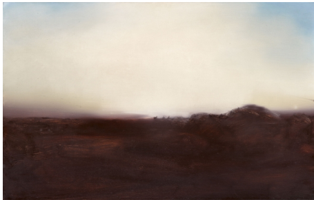
Gerhard Richter Teyde-Landschaft, 1971